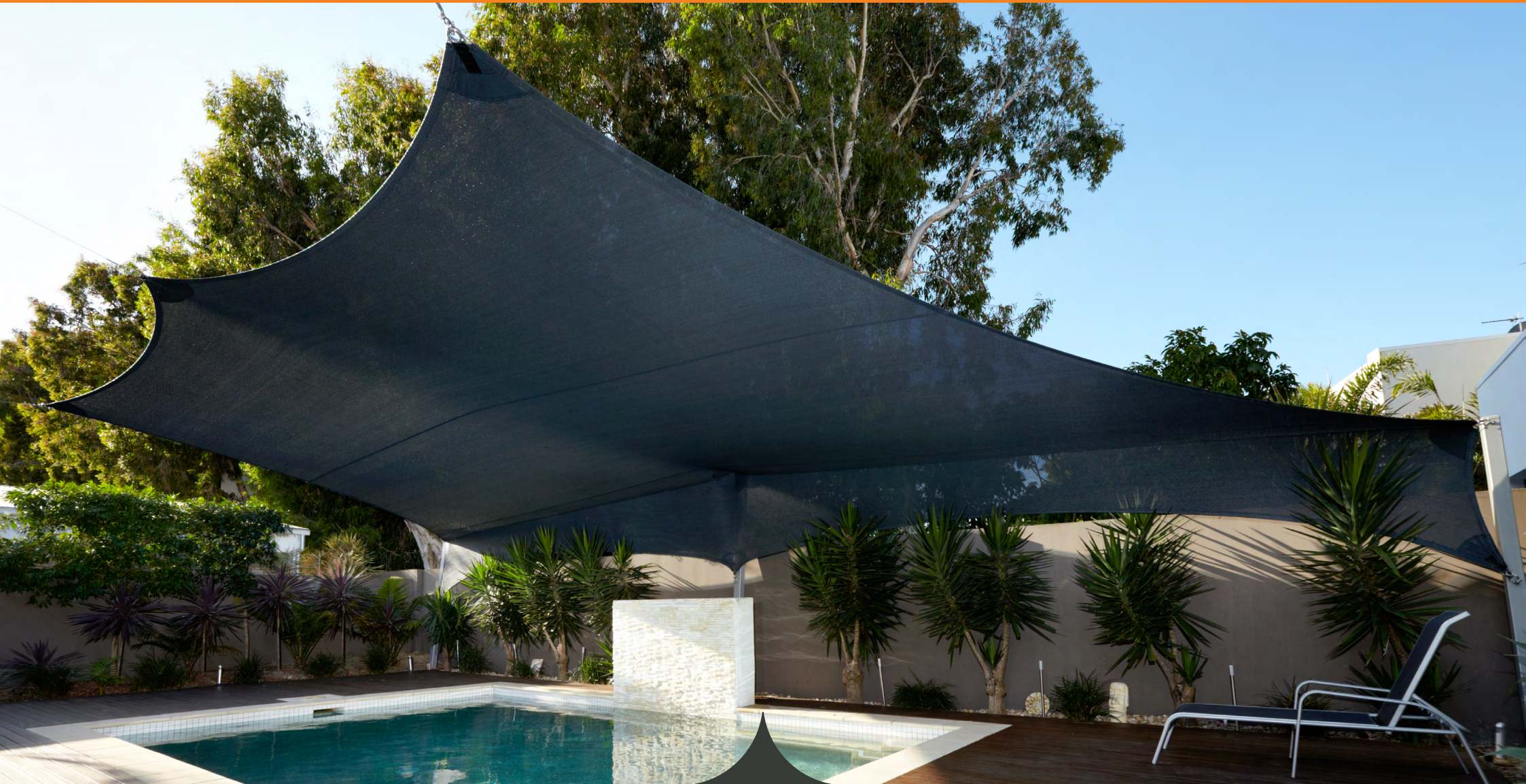
RAINBOW SHADE ✦